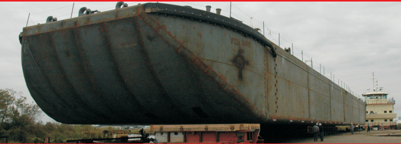
1300 Tons - No problem for the Mega PST's!

"I was really impressed with the performance of the new 8 wides. They handled the weight with ease and worked well together with our existing SPMT's. I'm glad we made the investment and I can see that we made the right choice. These 8 wides make our fleet more diverse and will be an asset to both Berard and our clients." - Braedon Berard